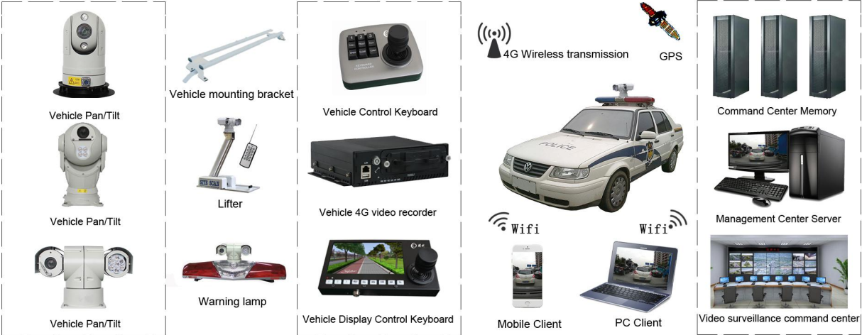
Front-end Camera Equipment