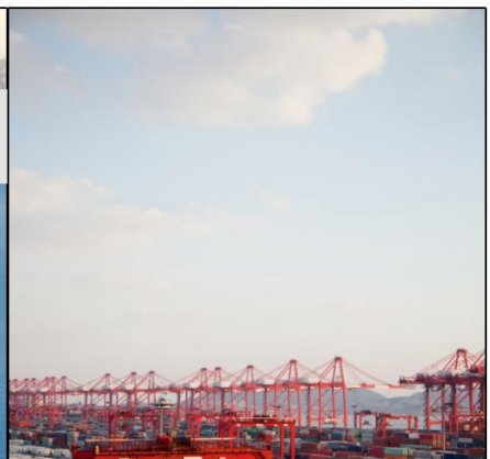
Pier, Port, Bridge